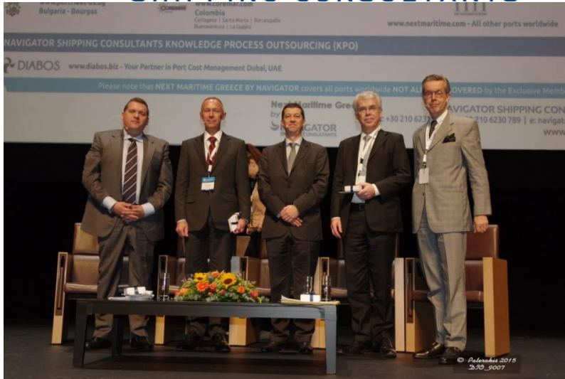
Foreign Ambassadors Panel: 'Climate Change and the Shipping Community'