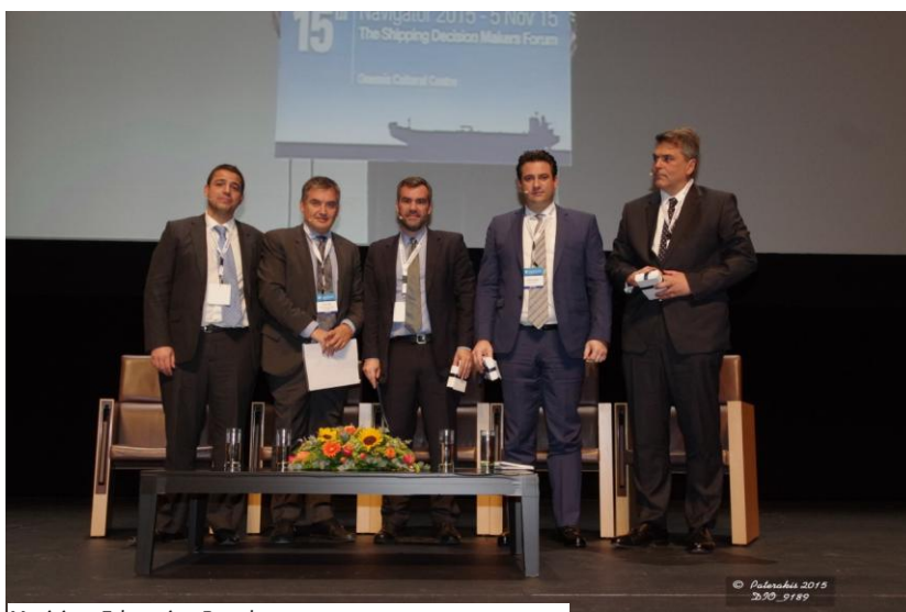
Maritime Education Panel