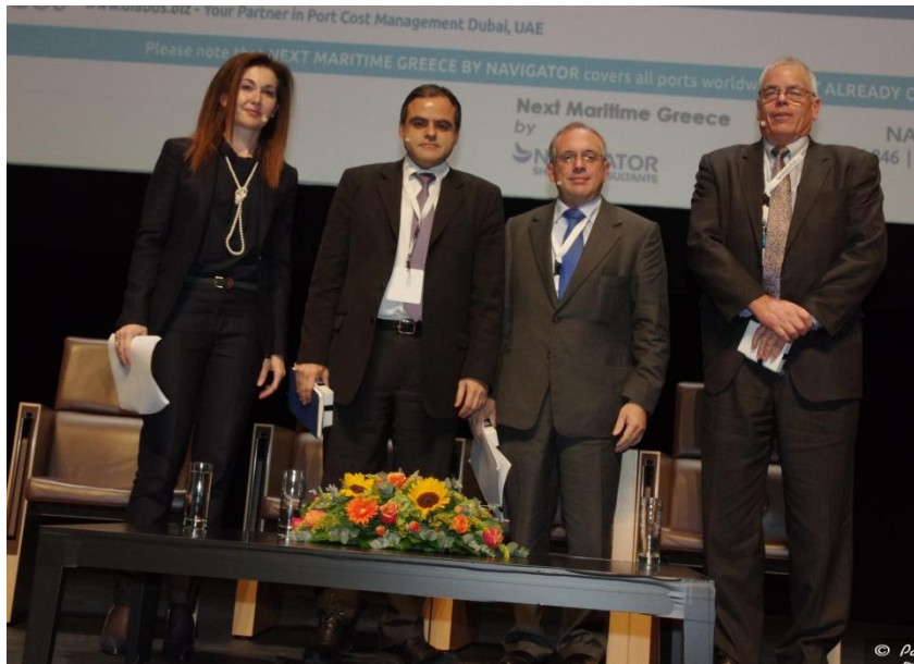
Technical & Operational panel: ‘Greening the Maritime Agenda’